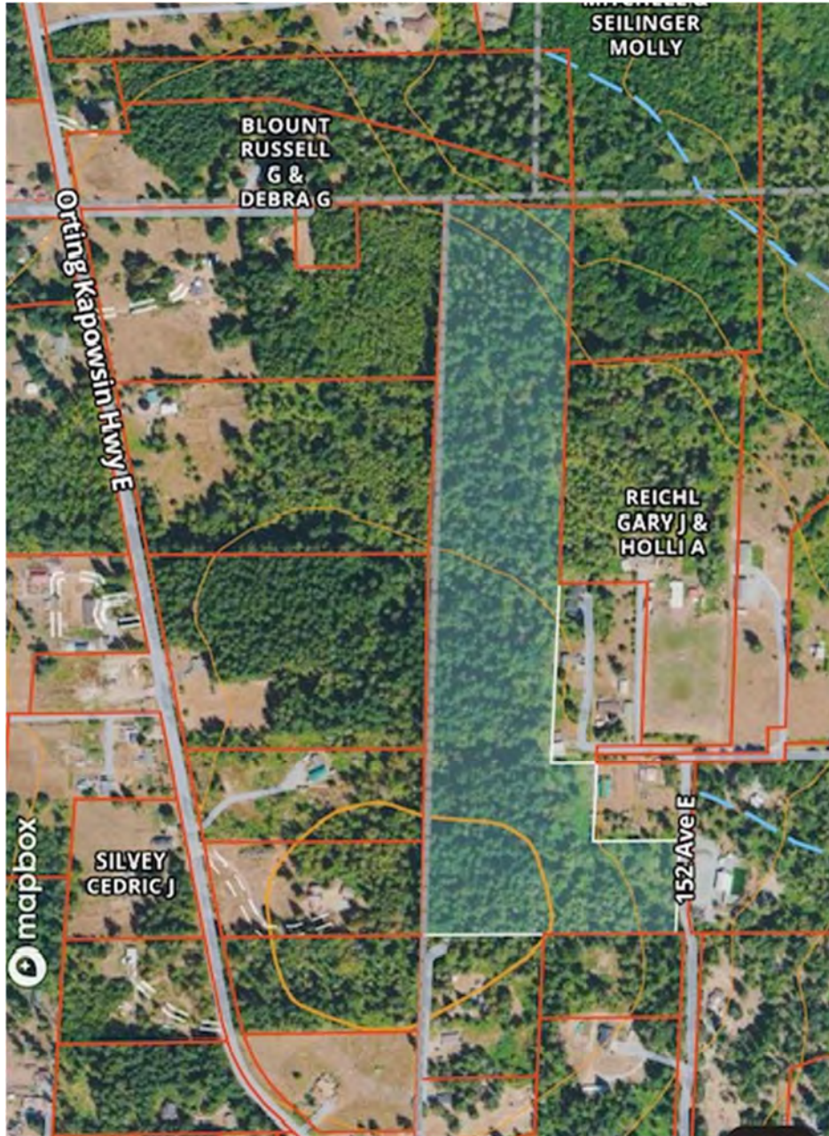
EXHIBIT A SITE MAP