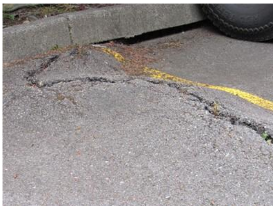
Fire Station 66-Multiple areas heaving found in parking lot area and curbs.