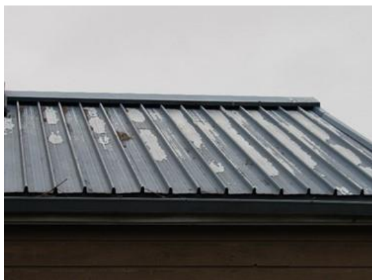
Fire Station 64-Metal roof appears to be corroding and/or paint peeling. Needs cleaning as well.