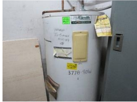
Fire Station 62-Original water heater from 1989.