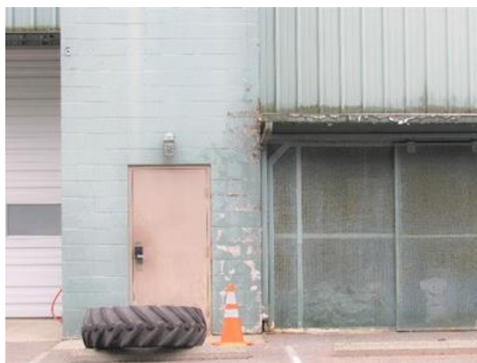
Fire Station 66-Multiple areas of metal and brick on exterior of building appears to have extreme rusting and/or paint chipping.