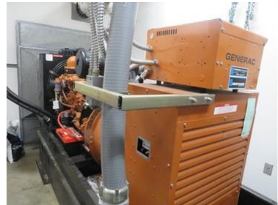
Fire Station 71-Generator found to be past useful service life.