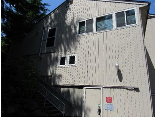
Fire Station 72/Storage-Exterior showing signs of wear. Pressure wash needed at minimum.