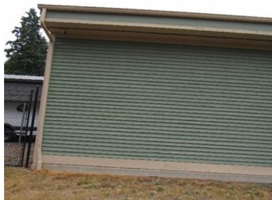
Fire Station 62-Multiple areas of paint peeling found on exterior of building.