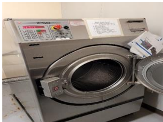
Fire Station 65-Older commercial washer found.