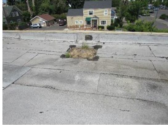
Fire Station 73-Torch down asphalt roof showing signs of wear and debris build up.