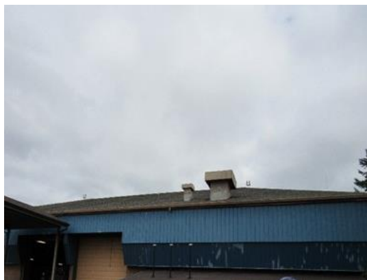
Fire Station 69-Metal exterior paint found to be chipping.