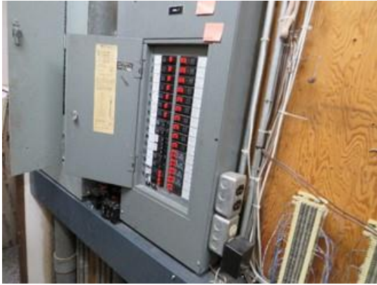
Fire Station 61-Original electrical panel from 1968.