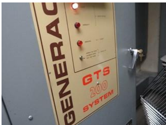
Fire Station 66-ATS found past useful service life.