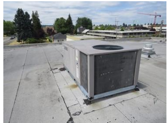
Fire Station 73-Rooftop package unit found to be past useful service life.