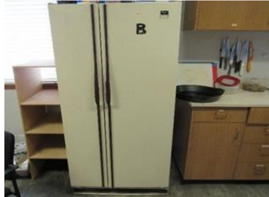
Fire Station 69-Refrigerator found to be past useful service life.