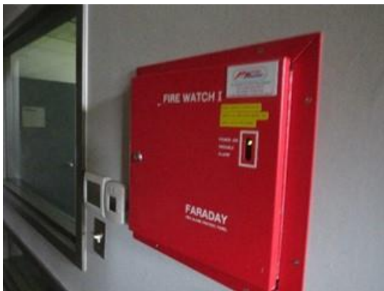
Fire Station 64-Obsolete Main Fire Panel.