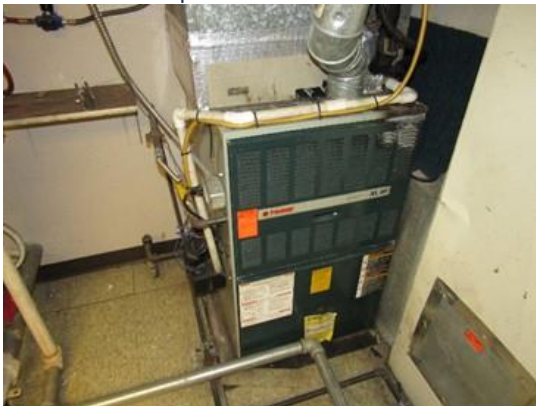
Fire Station 72/Storage-Furnace found to be past useful service life.