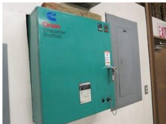
Fire Station 67-ATS found past useful service life.