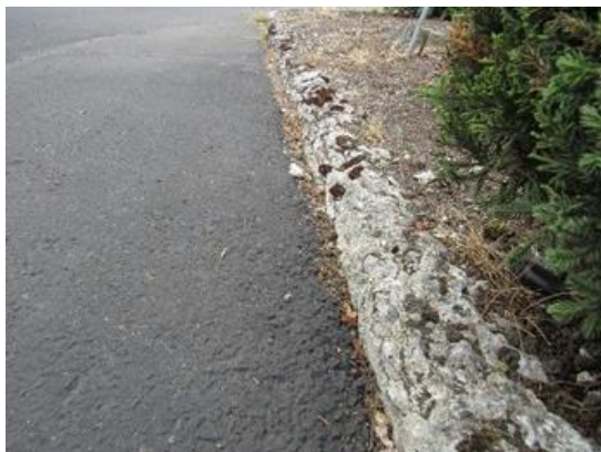
Fire Station 61-Curb damage found in several areas.