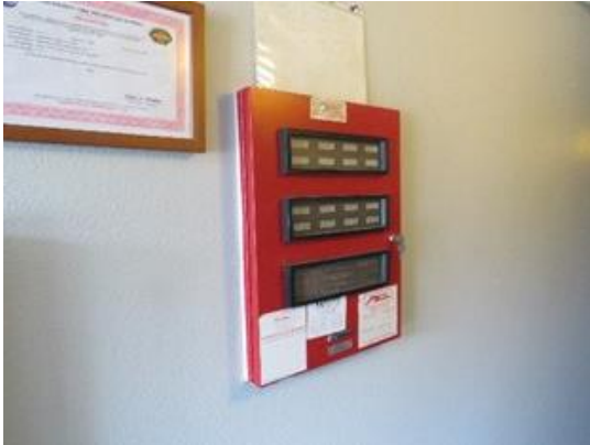
Fire Station 69-Obsolete Main Fire Panel.