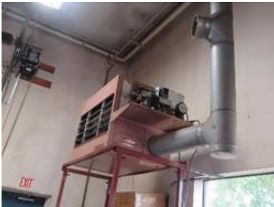
Fire Station 69/Maintenance Shop-Waste oil furnace found to be past useful service life.